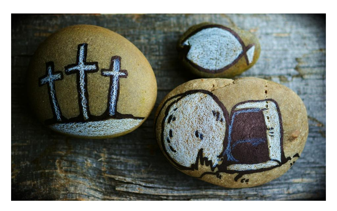
April 17, 2022