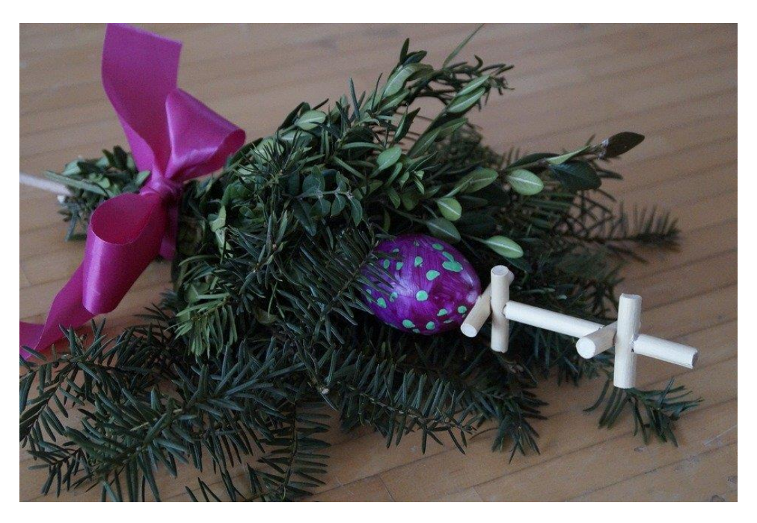
April 10, 2022