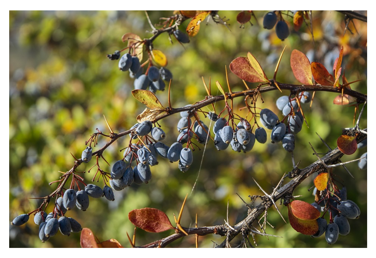
May 2, 2021 9:30 am

A Just Peace Church An Open and Affirming Congregation A God is Still Speaking Congregation