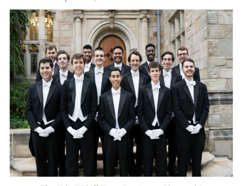
The Yale "Whiffs" are Coming to Plymouth! We are delighted to welcome the world's oldest and best known collegiate a cappella group to central New Hampshire.

Doors will open at 6:00 PM on Friday, April 20th. Arrive early to save a seat! Your donation of $20 will support the music program at Plymouth Congregational UCC.