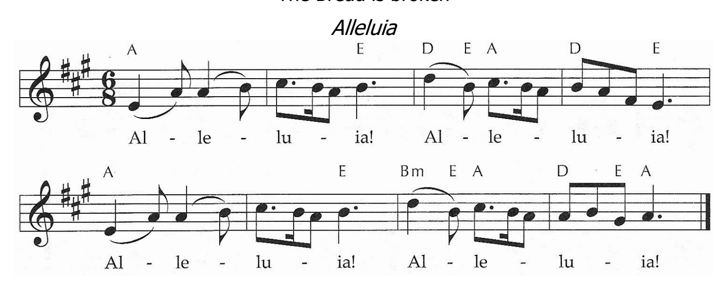
The Bread is broken

One: And we fill this cup with the fruit of the Earth: